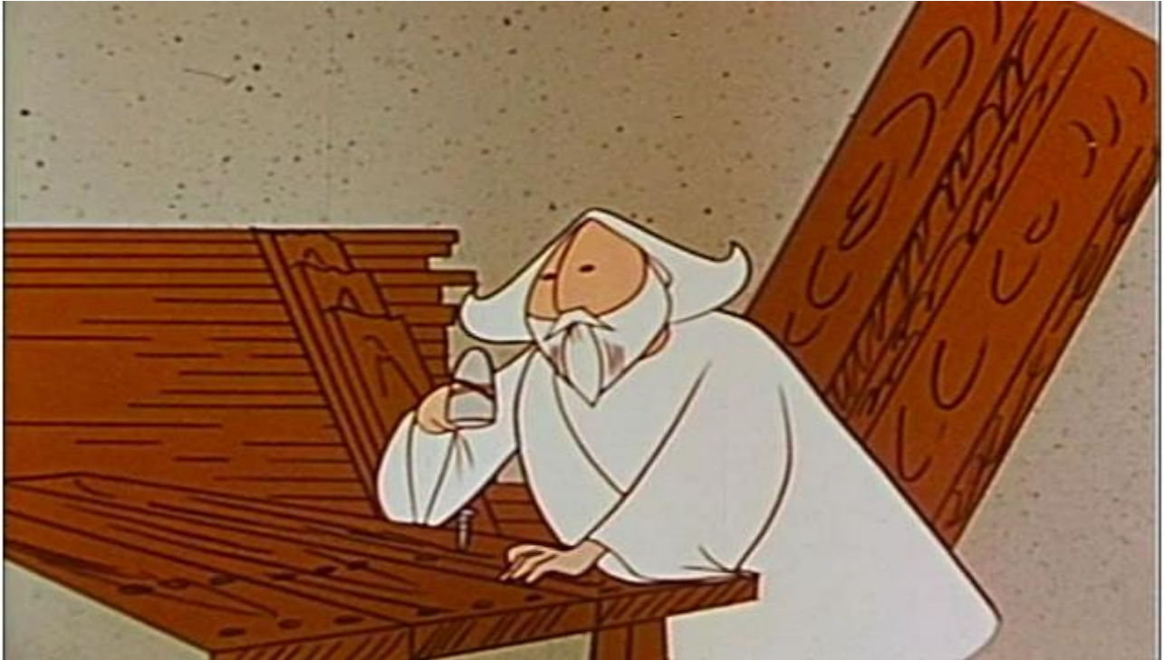
Noah started building the ark.